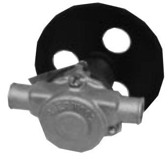
G45-2 & G46