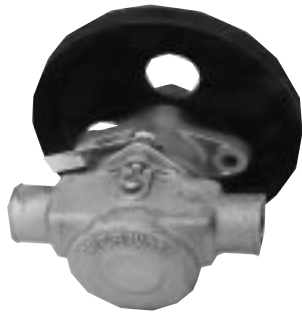
G5, G7, G7B & G50