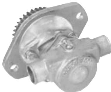
M70 & M71